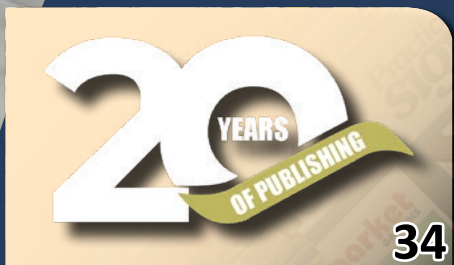
CELEBRATING 20 YEARS OF OUR MAGAZINE

Avery Dennison's new Supreme PPF Xtreme film will empower vehicle owners to safeguard their investment against the impact of tough environmental conditions in Sub-Saharan Africa. COVER STORY PAGE 32