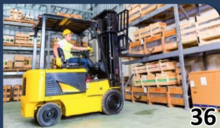
HOW 3D PRINTING IS A SOLUTION TO A SHORTAGE OF SPARE PARTS