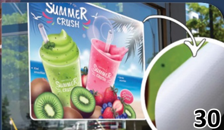
PATTERN COATING SCIENCE IS KEY TO PRINTABLE SELF-ADHESIVE PRODUCTS