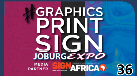
GEAR UP FOR BUSINESS IN THE GRAPHICS, PRINT AND SIGN INDUSTRY