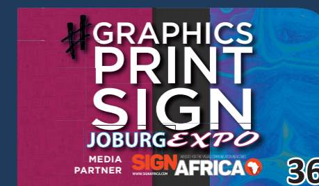
36 GEAR UP FOR BUSINESS IN THE GRAPHICS, PRINT AND SIGN INDUSTRY