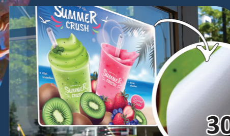
30 PATTERN COATING SCIENCE IS KEY TO PRINTABLE SELF-ADHESIVE PRODUCTS