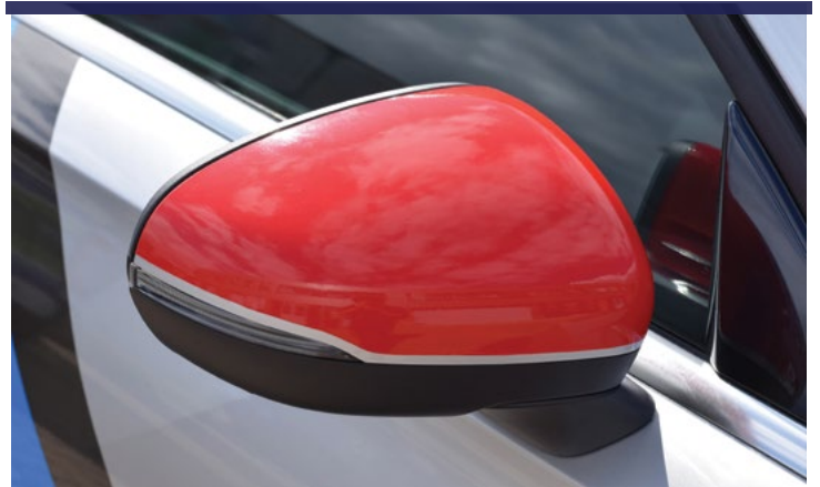
Sources: 3M, Avery Dennison, Grafityp, Orafol, HEXIS and Mactac Graphics.