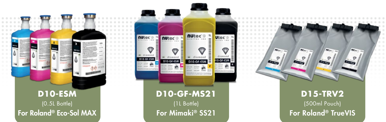
D10-ESM (0.5L Bottle) For Roland® Eco-Sol MAX

Choose DIAMOND eco-solvent, low smell, fast drying inks for your self-adhesive & flexible media needs.