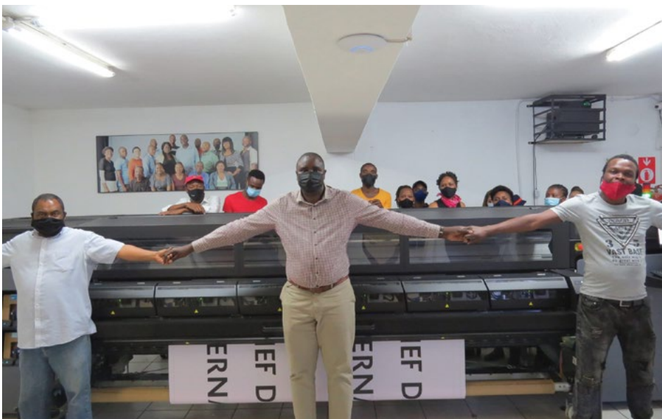
The Frame Fun team with the HP Latex 1500.